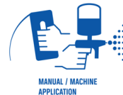
MANUAL / MACHINE APPLICATION